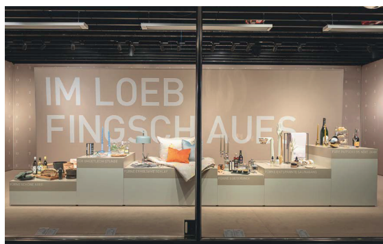
LOEB AG, SWITZERLAND