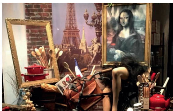
MILLY'S, NEW ZEALAND