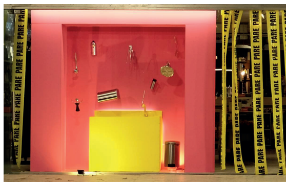
BAZAAR - LA BARRA, URUGUAY